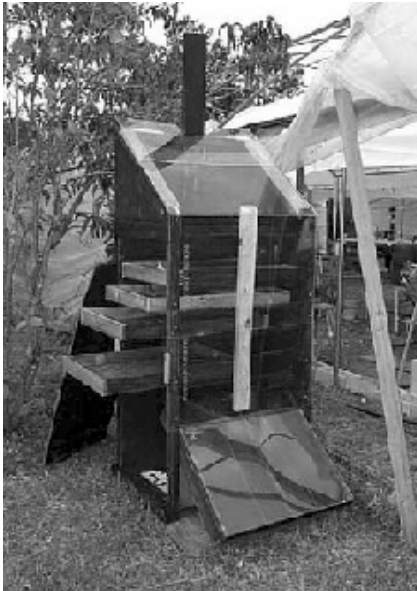
Trays slide out for easy loading

A flat rectangular piece of plastic or metal for the chimney. A metal stovepipe or a piece of PVC pipe would work as well. You will want to paint it black.