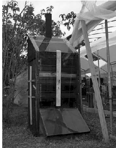
Front view of dryer