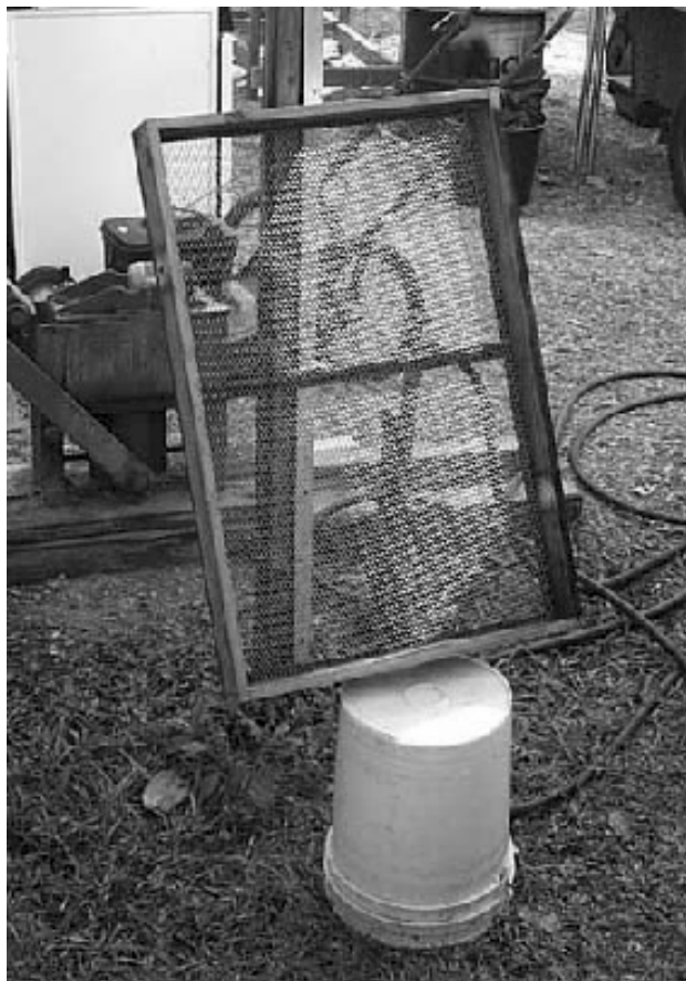
Two views of the drying rack.